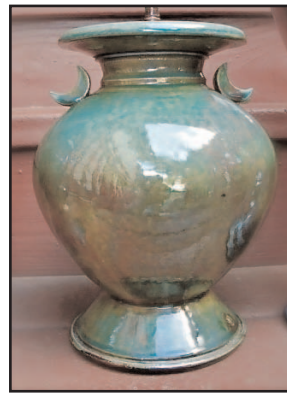
Enlightened by Larak Briscoe

I remember visiting Gustav Vigeland's sculpture park in Oslo, Norway, and being astounded at his ability to catch emotions. I walked down a grand flight of steps between two sculptures, viewing the backside of two different couples. I saw no facial features, just the simple bulk of shoulders and torso, in smooth marble. Yet, one set of stone communicated anger, the other love. Amazingly, Vigeland caught the essence of the couple's body language from the back, in stone.